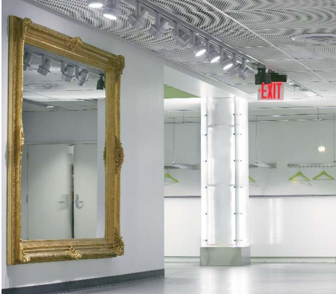
Product: SQUARELINE® Metal Ceiling Tiles Application: Theater performing arts Architect: Beyer Blinder Belle Architects and Planners, LLP