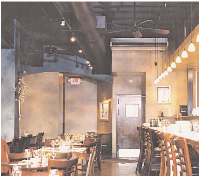
Product: SONEX® Panels in charcoal colortec® Application: Restaurant