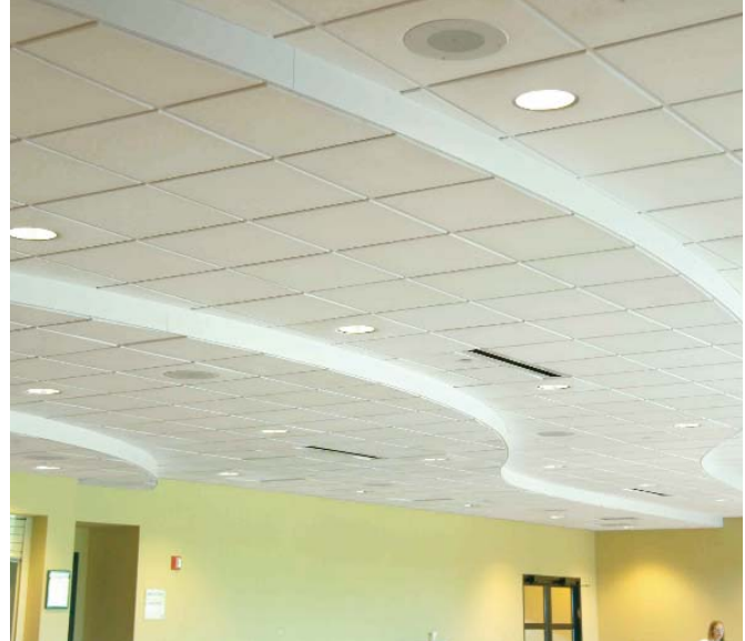
Product: CONTOUR® Ceiling Tiles Application: Cafeteria Architect: Turok Architecture, Inc.