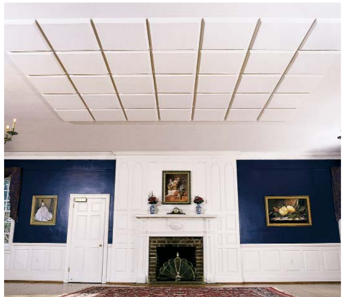
Product: CONTOUR Ceiling Tiles Application: Ballroom in historic manor

To learn more about these and other applications, visit our website at www.pinta-acoustic.com/ent .