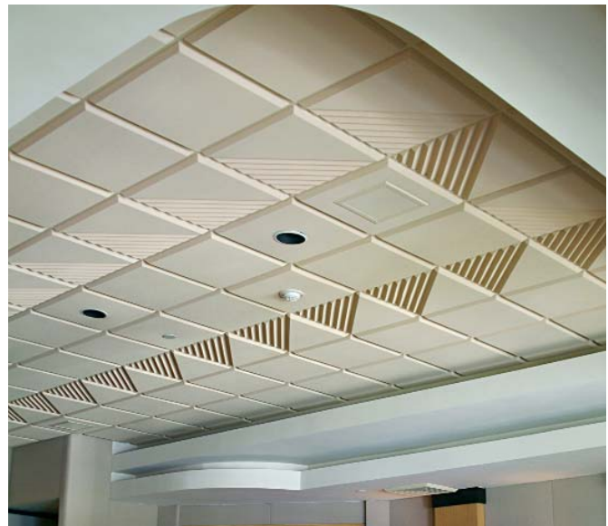
Product: CONTOUR Ceiling Tiles Application: Dining room

To learn more about these and other applications, visit our website at www.pinta-acoustic.com/ent .