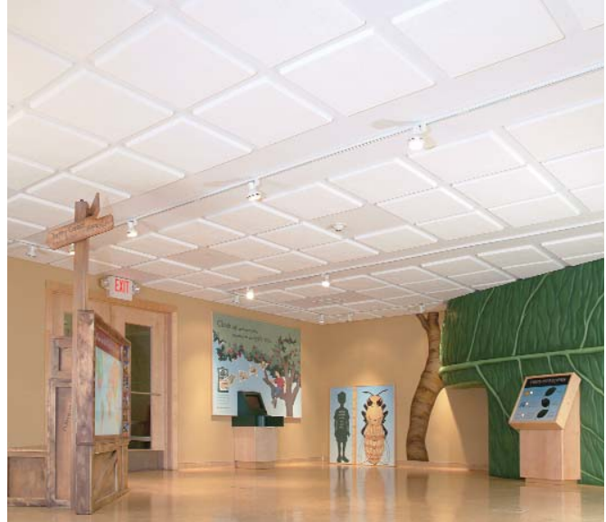
Product: CONTOUR® Ceiling Tiles Application: Learning resource center