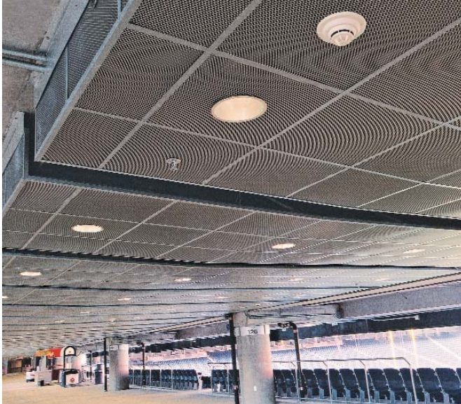
Product: SQUARELINE® Metal Ceiling Tiles Application: Concourse of Reliant Stadium Architect: Lockwood, Andrews and Newman, Inc.