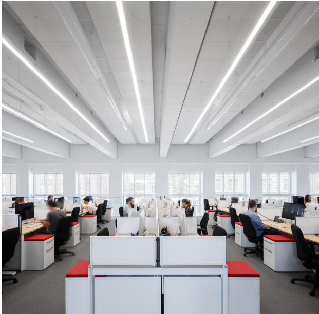
La Presse, Workstations: SONEX® Plano Absorbers