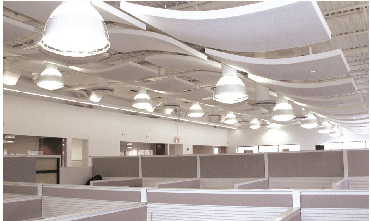
Stony Brook Medicine, Workstations: WHISPERWAVE™ Clouds

One of the biggest stress and productivity factors in an office are excessive ambient noise levels from conversations. Installing acoustic products helps improve efficiency, comfort and communication.