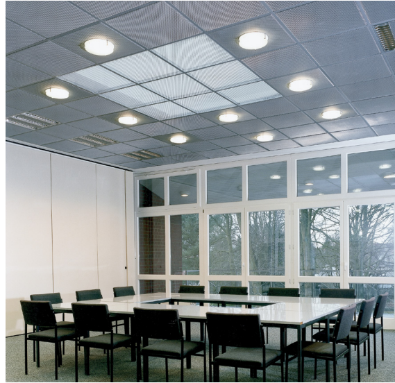
Conference Room: SQUARELINE® Metal Ceiling Tiles