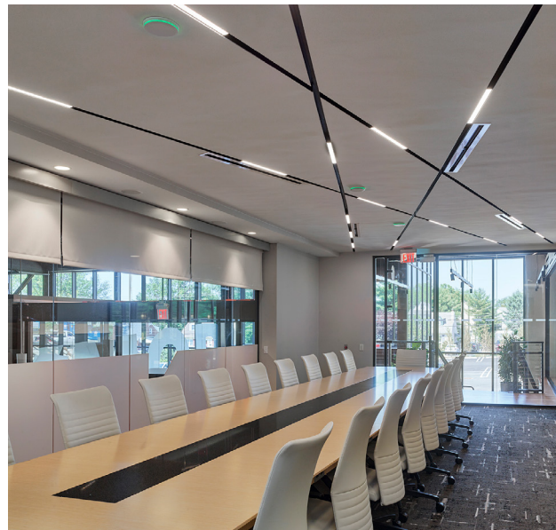
Brixmor Property Group, Meeting Room: SONEX® AFS Acoustic Plaster System